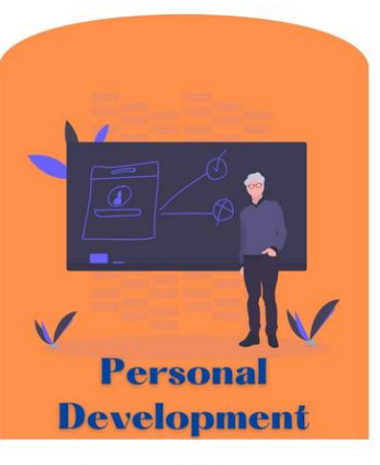
Develop your skills in areas that inspire you to improve yourself.