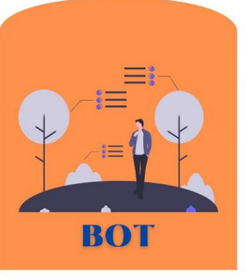
Develop your trademark examination skills with Moodle courses.