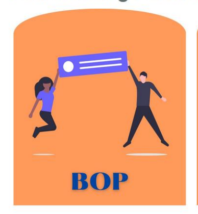
Use Moodle to learn or update your patent examination skills.